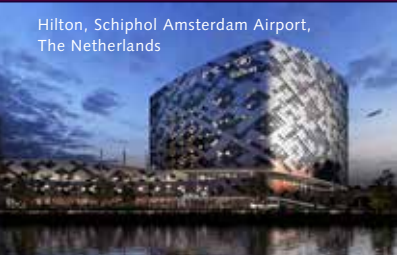
Hilton, Schiphol Amsterdam Airport, The Netherlands

Forest curtain tracks and the Forest Shuttle® motorized curtain tracks are manufactured and marketed worldwide by Forest Group Nederland BV, based in Deventer, The Netherlands. Thanks to their unique quality characteristics and noiseless smooth operation, these pure Dutch products have been used in many homes, offices and 5 Star hotels, all over the world.